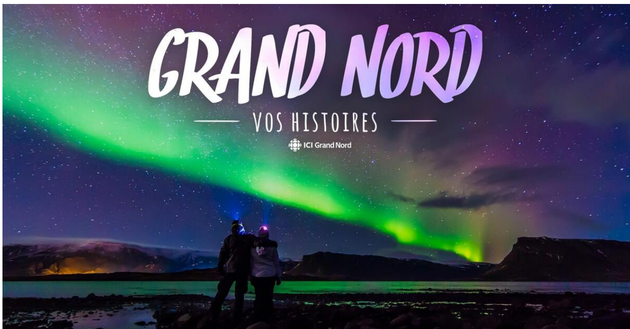
ICI Grand Nord: the French-language public broadcaster north of 60 (Radio-Canada)

We are mindful of the challenges this has created for Indigenous cultural preservation, languages and participation in the Canadian media industry. We also recognize Indigenous Peoples are dedicated to culture and language revitalization. As the national public broadcaster, we support the promotion and production of content reflecting the languages and cultural values of Indigenous Peoples living in a French-speaking environment.