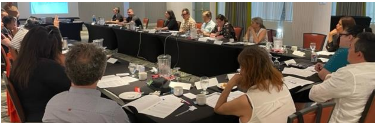
Iqaluit Engagement Session, July 2022.

– Final Report, French engagement sessions.