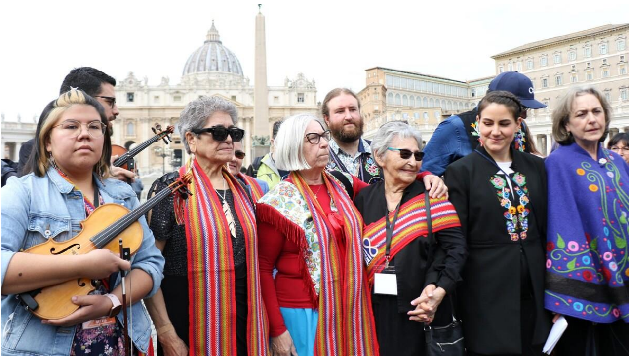
Members of the Métis delegation gathered in St. Peter's Square at the Vatican shortly before their meeting with the Pope to discuss Canadian residential schools.