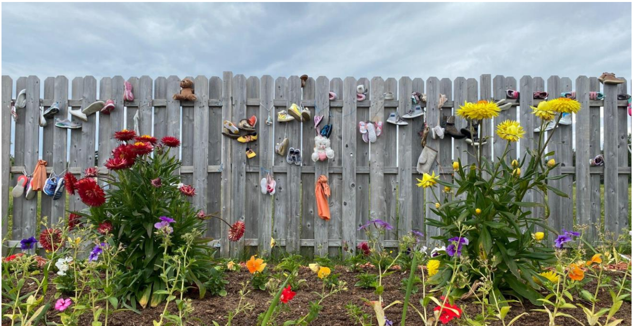
Flowers grow and shoes hang from a fence at the site of the former Notre-Dame residential school, to remember and honour the children who never returned home from residential school.