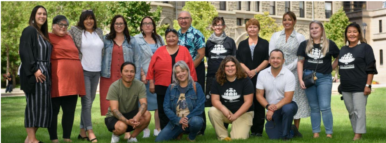
Members of the All Nations Employee Resource Group